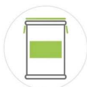
250 Kg DRUM