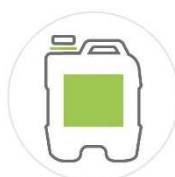
8 Kg CANISTER

Please verify the packaging details, including volume and availability, with your sales representative, as they may vary depending on the production facility where the product is manufactured.