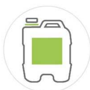
15 Kg CANISTER