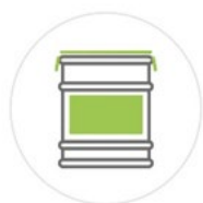
35 Kg DRUM