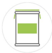
255 Kg DRUM